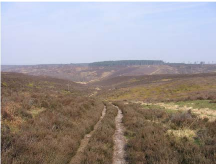
Picture 13.1 Cannock Chase SAC